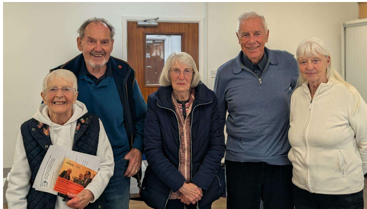
A few of the Bromsgrove u3a members at their first AbilityNet training session.